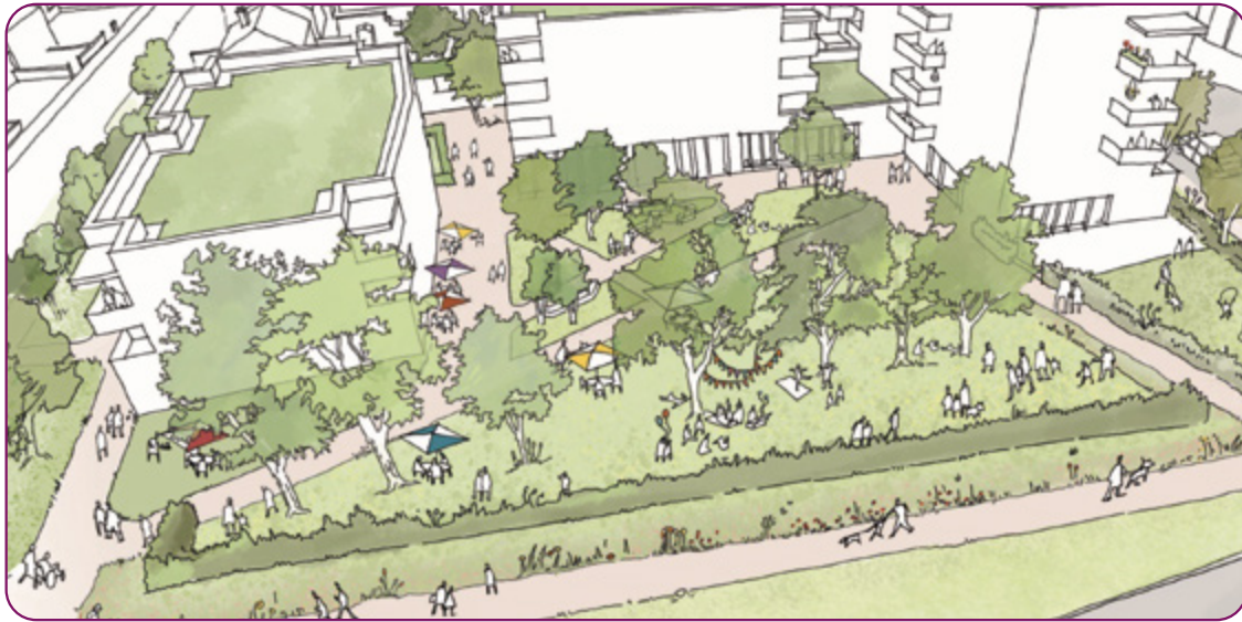
Fig 11: Indicative public realm – Green open space – example from elsewhere in London

The placement of the new buildings will be carefully considered to ensure there is no adverse impact on the adjacent neighbours, the adequate distances will be kept ensuring the privacy is maintained and there are no overlooking issues. The improvements to the pavements, lighting, landscaped edges will benefit all, existing and the new residents. The intention is that all homes on the estate will be tenure blind, this means that all new homes on the estate will be of the same quality, regardless of tenure.