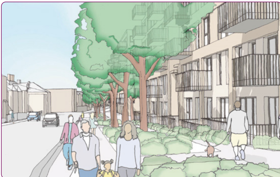
Fig 12: Indicative public realm – existing and new buildings street example – from elsewhere in London

The placement of the new buildings will be carefully considered to ensure there is no adverse impact on the adjacent neighbours, the adequate distances will be kept ensuring the privacy is maintained and there are no overlooking issues. The improvements to the pavements, lighting, landscaped edges will benefit all, existing and the new residents. The intention is that all homes on the estate will be tenure blind, this means that all new homes on the estate will be of the same quality, regardless of tenure.