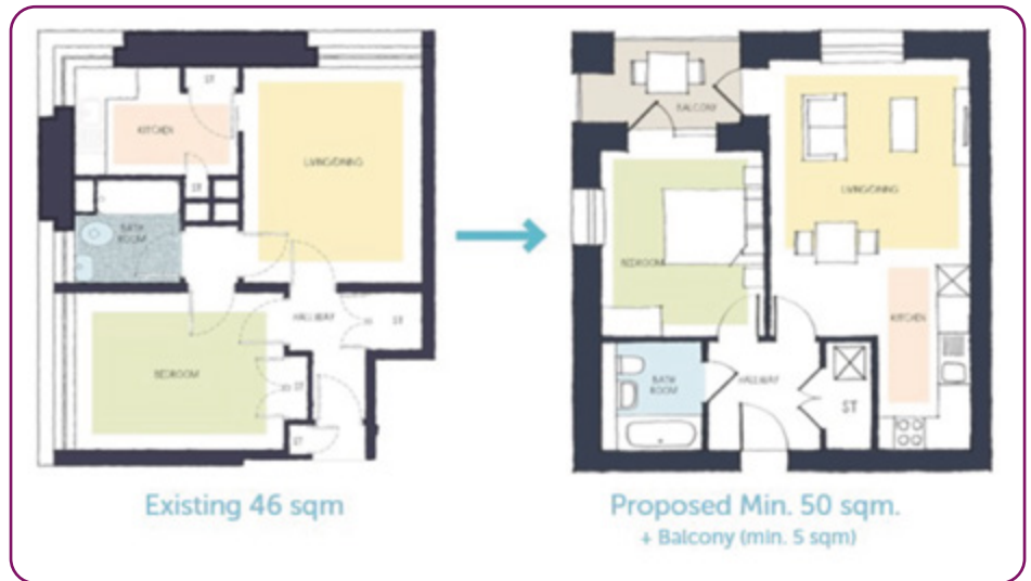
Fig. 6: Existing and new 2-bedroom flat size comparison